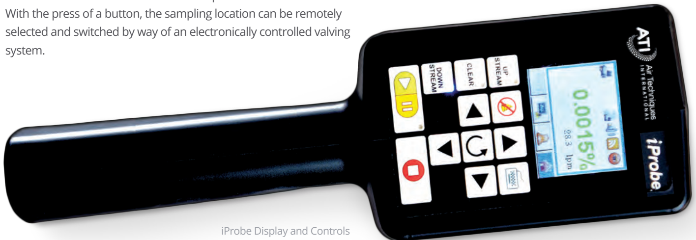
iProbe Display and Controls

The iProbe with a 12 ft cable acts as an extension of the base instrument through a nearly identical user interface. All status and selection icons from the base unit are represented on the iProbe. With the press of a button, the sampling location can be remotely selected and switched by way of an electronically controlled valving system.