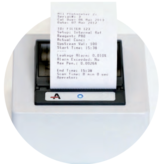
Optional Printer & Sample Report

Three unique report functions are now available with the 2i through the USB or optional thermal printer interface. Continuous mode offers the same output as ATI's legacy photometers to ensure backward compatibility. Monitoring mode provides the ability to collect data at user defined intervals for long term sampling. Summary mode, which gives discrete reporting capability for individual filter locations, can output to the thermal printer to meet customer documentation requirements.